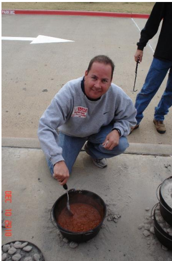
Dutch Oven Cooking

OTF needs 3 high-quality, informative, professional videos demonstrating how the Outdoor Adventures' Survival Skills, Orienteering and Outdoor Cooking units can be taught.