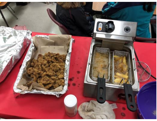
Fried Venison Backstrap

The OTF needs your success stories. How did Outdoor Adventures change a student's life? Hunting, fishing, archery, outdoor cooking stories. Share an incredible story your student shared because they took your class. Send me an email with your story and pictures if you have them.