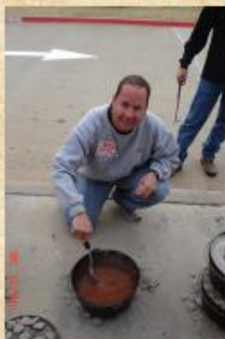
Dutch Oven Cooking

OTF needs 3 high-quality, informative, professional videos demonstrating how the Outdoor Adventures' Survival Skills , Orienteering and Outdoor Cooking units can be taught.