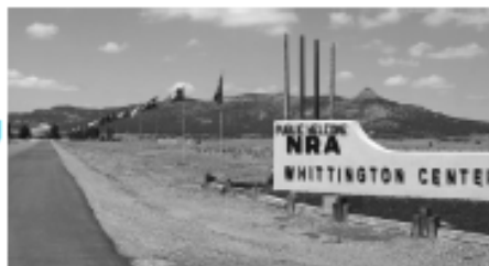
NRA Adventure Camp visit: http://nrawc.org/adventure-camp/

Contestants essays will be reviewed by a committee and a winner will be announced on or before May 1, 2017.