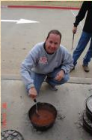
Dutch Oven Cooking

OTF needs 3 high-quality, informative, professional videos demonstrating how the Outdoor Adventures' Survival Skills, Orienteering and Outdoor Cooking units can be taught.