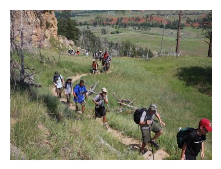
FINDING OUTDOOR ADVENTURES

<u>Discover the Forest</u> This new, exciting website is jam-packed with fun activities that you can do outdoors. The website also has a 'nature finder' feature that will help you and your parents find nature nearby.