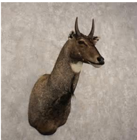
Nilgai Shoulder Mount