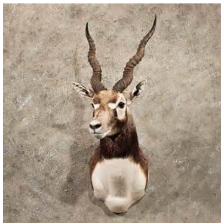
Blackbuck Antelope Shoulder Mount