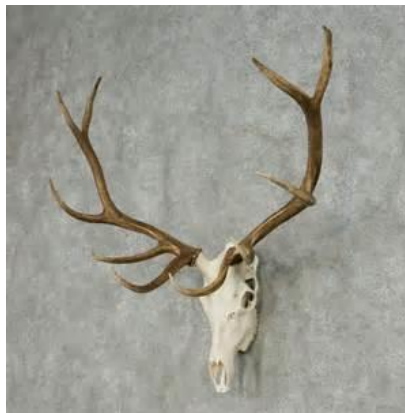
Elk European Mount

3 mounts to be donated by private donor, not the OTF (images are just for show, not actual mount):