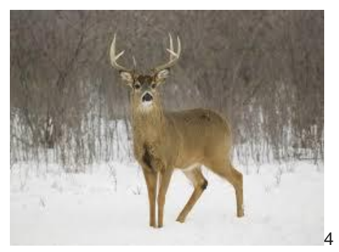
Whitetail shoulder mounts