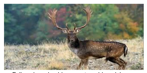
Fallow deer shoulder mount - gold medal