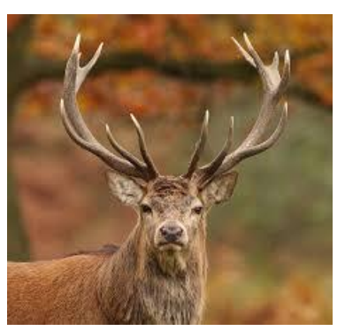
Red stag shoulder mount -380 pt