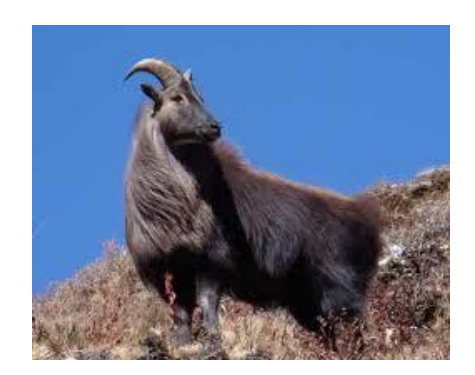
Full body tahr

8 mounts to be donated by private donor, not the DEF (images are just for show, not actual mount):