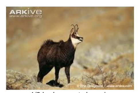
1/2 body mount chamois